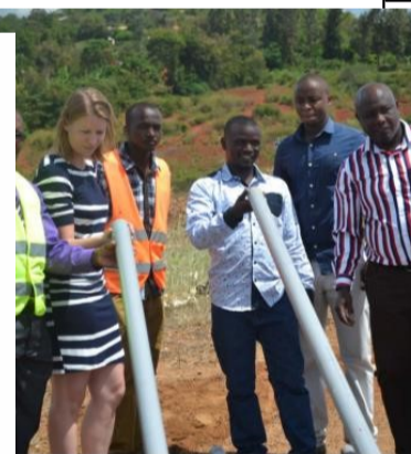
Contribution to VEI's project portfolio